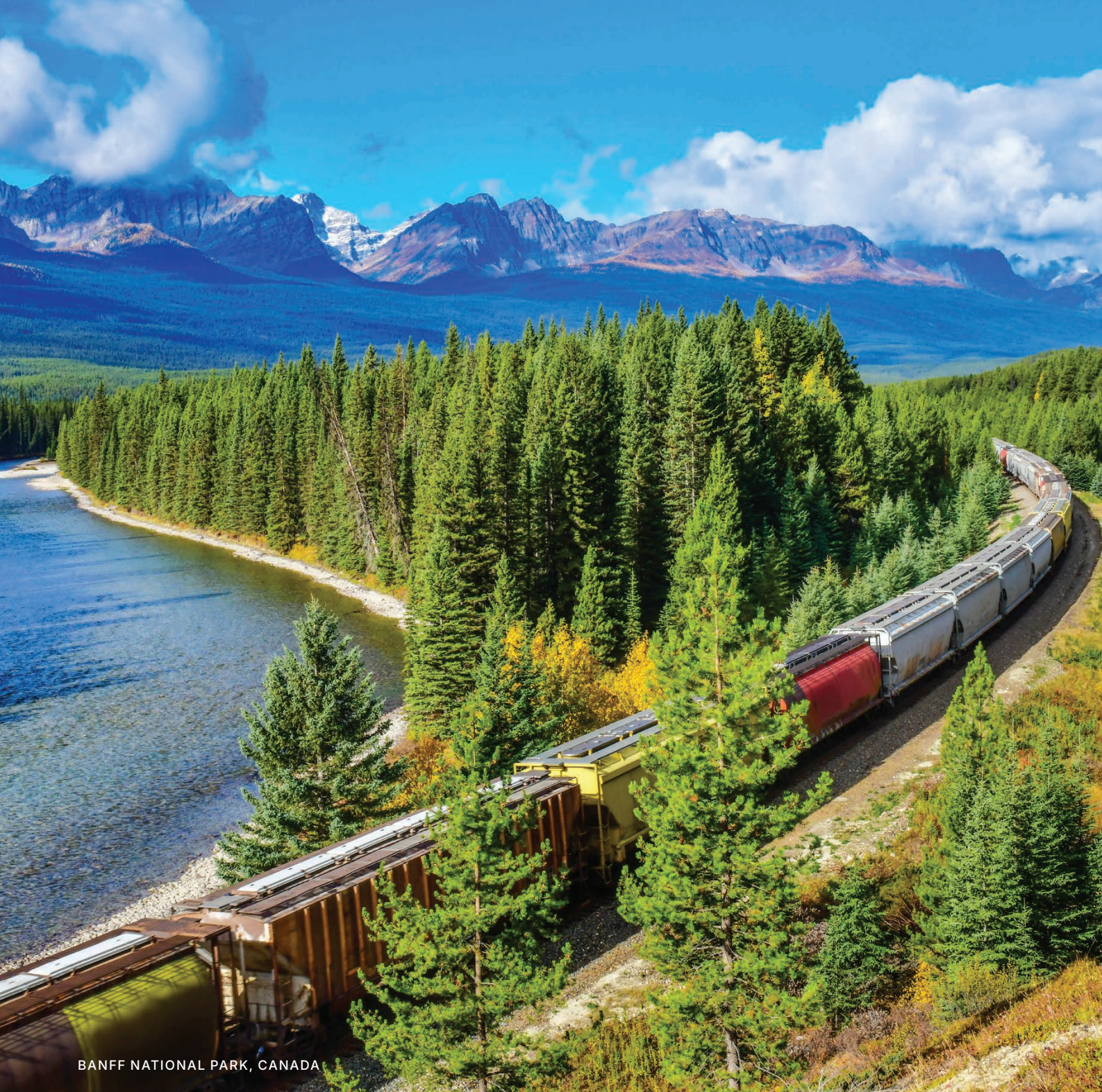
BANFF NATIONAL PARK, CANADA