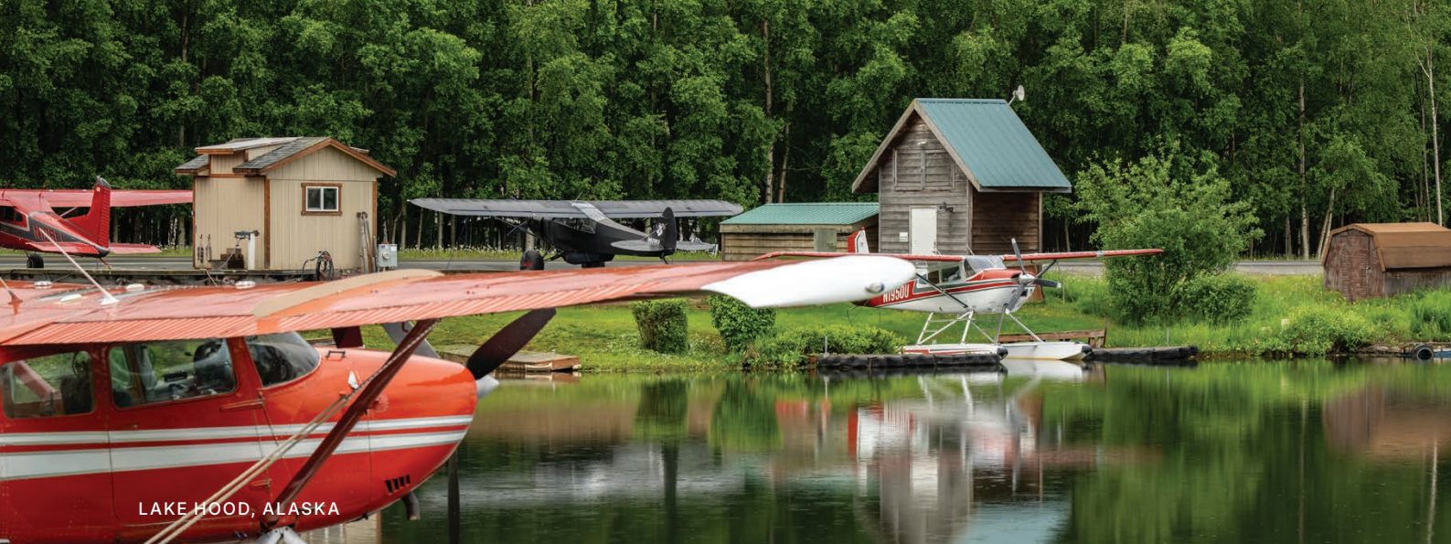
LAKE HOOD, ALASKA