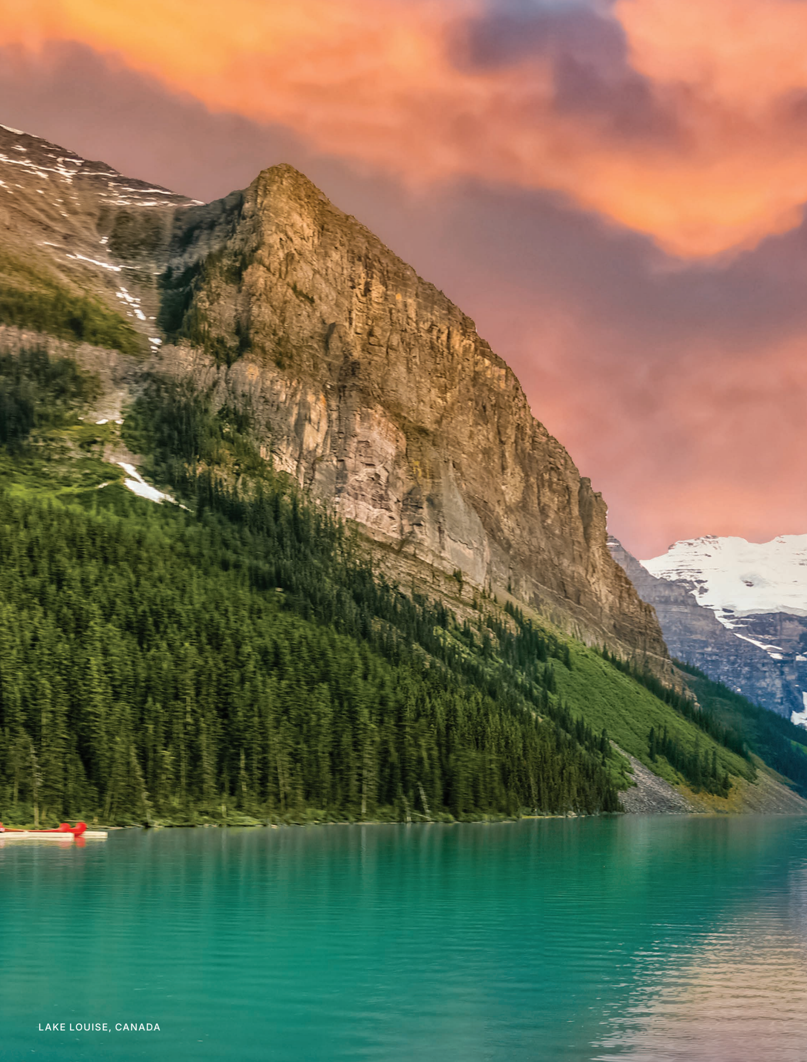
LAKE LOUISE, CANADA